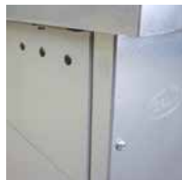
Prepared for cable gland mounting,