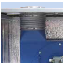
Flex connection - only for clean air. Mounted on inlet and outlet.