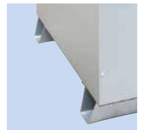
Easy anchoring at firm surface.