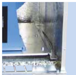
Mounted on vibration dampers.